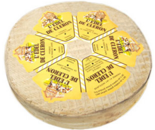
EDEL DE CLERON