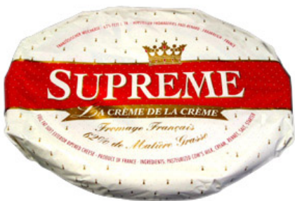
FRANCE BRIE SUPREME