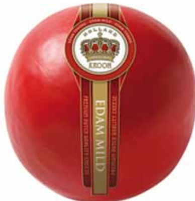
EDAM BALL HOLLAND