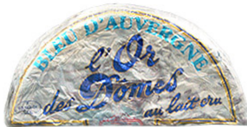
BLEU AUVERGNE AOC FRENCH