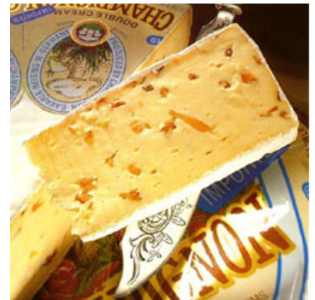
BRIE MUSHROOM GERMAN