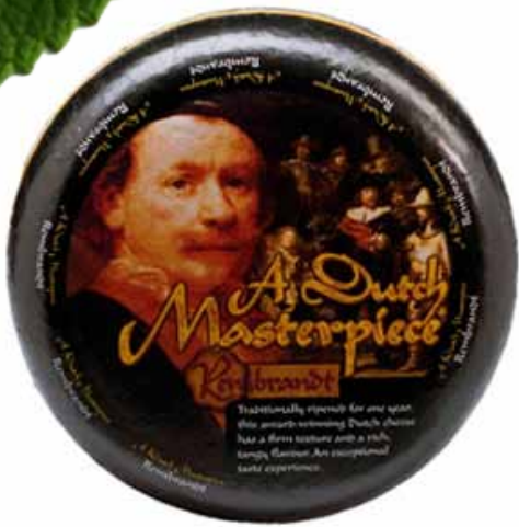
GOUDA AGED REMBRANDT