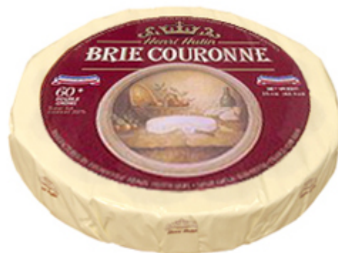
BRIE PLAIN 1 KILO