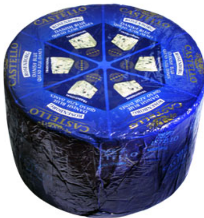
BLUE WHEEL DANISH