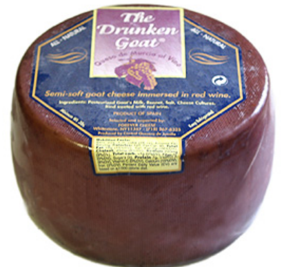
DRUNKEN GOAT CHEESE