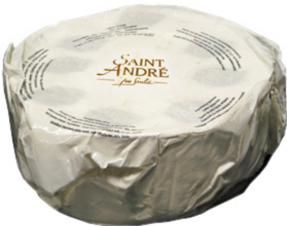
ST ANDRE FRENCH

Please note, this list is not all-inclusive. We do our best to keep the information as up to date and as accurate as possible, but we do introduce and discontinue products all the time, so keep your eyes open and always read product labels.