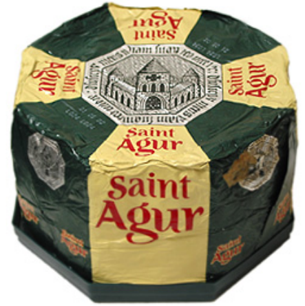
SAINT AGUR 60% FRENCH