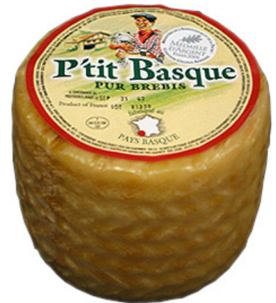
CHEESE PETIT BASQUE FRENCH