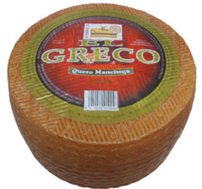
MANCHEGO 6 MONTH