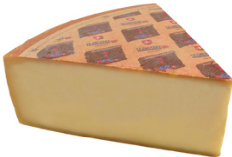
GRUYERE QUARTER WHEEL RESERVE