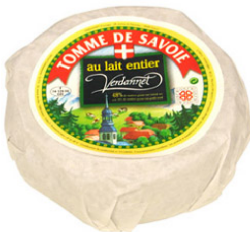
TOMME DE SAVOIE RAW MILK