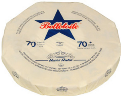
BELLETOILE TRIPPLE CREAM