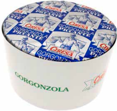
GORGONZOLA MOUNTAIN PICCANTE