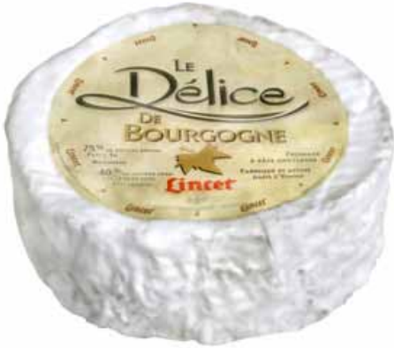
DELICE DE BOURGOGNE TRIPLE CREME