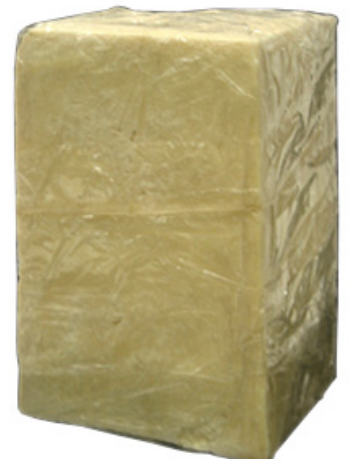
PECORINO ROMANO QUARTER